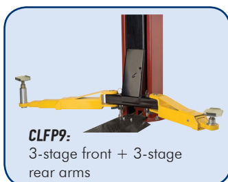
CLFP9: 3-stage front + 3-stage rear arms

The CLFP9 features a 10' 7/8" overall column height, making it ideal for low ceiling applications. Standard front and rear 3-stage arms provide maximum arm sweep, arm retraction and reach. CLFP9 will accommodate a wide variety of vehicle lifting points, including short and long wheelbase and wide body imports.