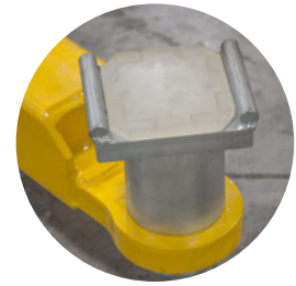
Double screw footpad with engineered frame engagement