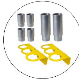
Truck adapter set included

Our E Series lifts provide symmetric lifting capability with adjustable height to accommodate higher profile vehicles. A pulley-less jacketed single-point lock release system reduces wear and allows for simpler repairs. All necessary truck adapters are included. ALI/ETL certified. Available in red or blue.