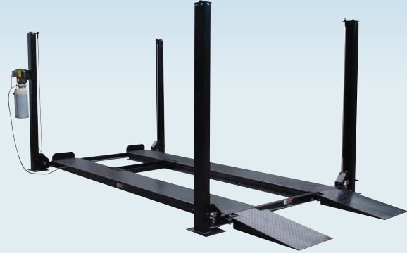
FP8K-DS Deluxe Series Storage / Service lift

Smooth operation and good looks make a great first impression but it's the safety features and durability that makes the "Deluxe Series" the best choice in storage/service lifts.