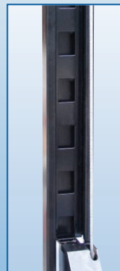
Internal ladder locking system