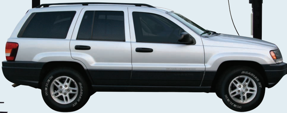
FP8K-DS-XLT Extra length & under car clearance