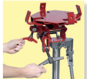
Easy grip crank knobs