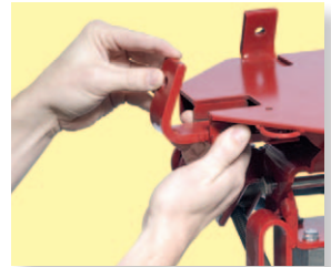
Four quick ratcheting brackets