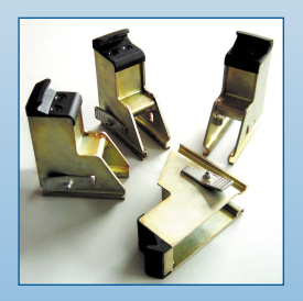
Optional: Motorcycle adapters