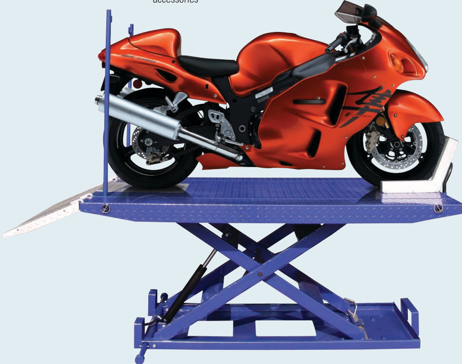
M-1500C-HR Motorcycle lift shown with standard accessories

These lift tables are ideal for making repairs to motorcycles, snowmobiles, ATVs, jet skis, etc. Choose from a range of accessories to customize these tables for your shop.