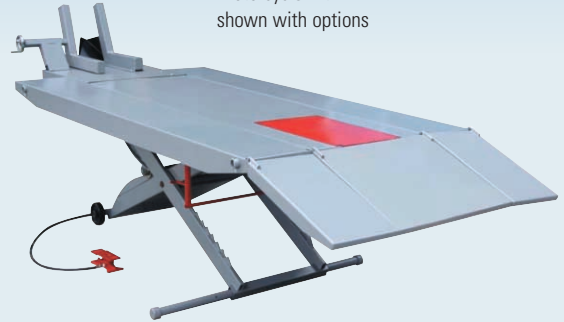
M-1000C Motorcycle lift shown with options