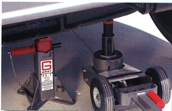
Gray Vehicle Support Stands shown in use (page 15).