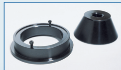
Optional: Light truck cone set –