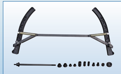
Optional: motorcycle adapter kits –